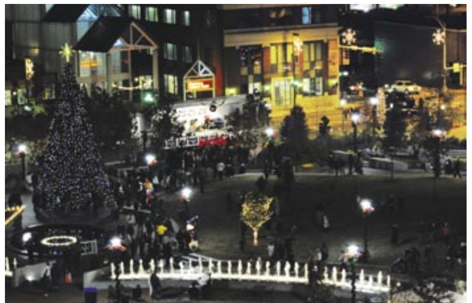
Center City Park, 2008 Festival of Lights, Greensboro.