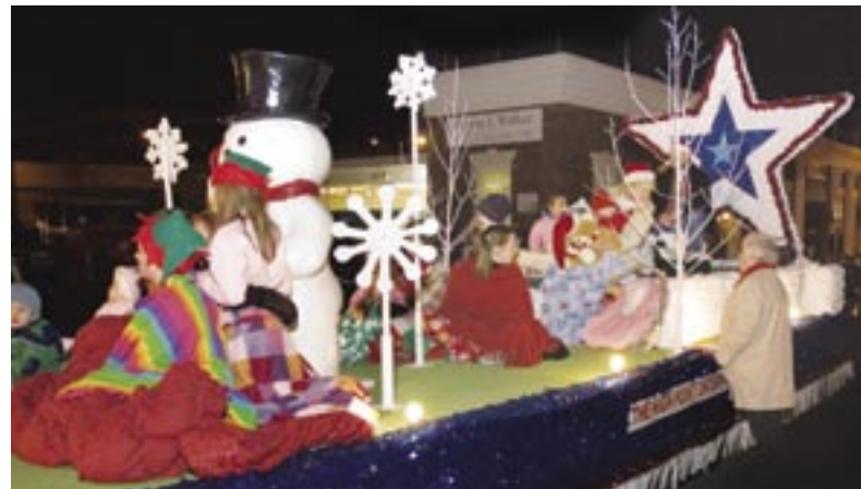
A float in High Point's nighttime parade.

Route begins at 401 N. Greene Street (Jaycee Building), continues south on Greene, turns left on East Market Street, then turns left on Church Street. Parade route ends in front of the Greensboro Children's Museum.